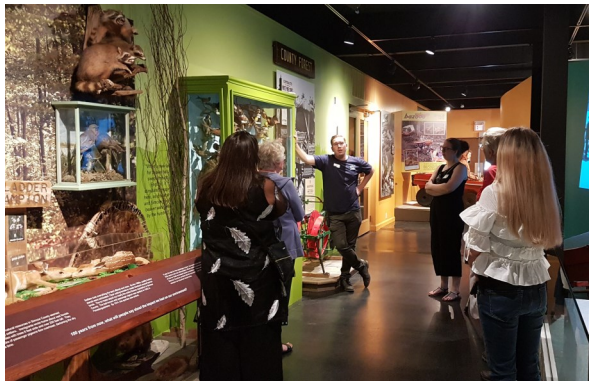
An inside tour of the Simcoe County Archives**