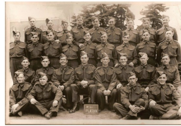
The Royal Regiment of Canada, D Company, 21 Platoon (1941)