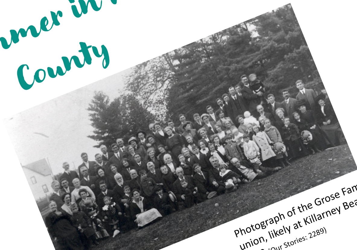
Photograph of the Grose Family Reunion, likely at Killarney Beach 1912 (Our Stories: 2289)