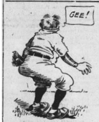
Barrie Examiner 14 June 1923