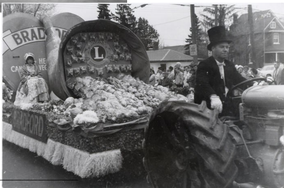
Horn of Plenty 1967 Bradford's entry in the parade—vegetables spilling from Cornucopia (Our Stories: 3265)